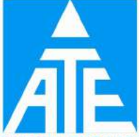
ALFATECH THERMAL ENGINEERS PVT. LTD.