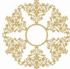
ORNATE Live Luxury